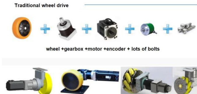
Figure 2. Traditional wheel drive components-wheel, gearbox, motor, encoder and bolts. AGV driving wheel BLDC motor drive unit assembly for electric vehicle.

Related tests show, there is abnormally high losses that exist in some planetary topologies. Some gear meshes may encounter both high speeds