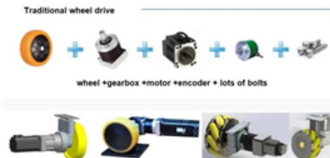
Figure 5. Traditional wheel drive components-wheel, gearbox, motor, encoder and bolts. AGV driving wheel BLDC motor drive unit assembly for electric vehicle.

It successfully and innovatively remove,