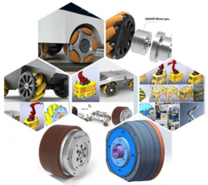
Figure 7. HSOAR precision cycloidal wheel reducer for mobile robot platform.