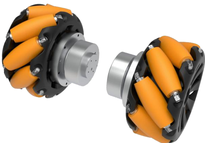
Figure 3. Mecanum wheel, a conventional wheel with a series of rollers attached to its circumference with an axis of rotation at 45° to the plane of the wheel in a plane parallel to the axis of rotation of the wheel.