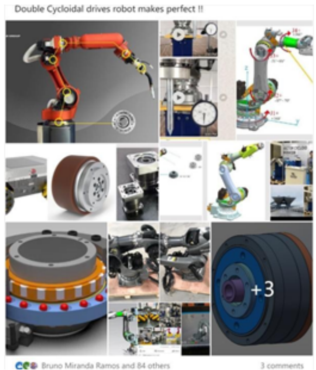
Figure 8. Automated welding robot, manifold with vent, configuration of the 6-DOF heavy payload industrial robot, drive wheel, gearbox.