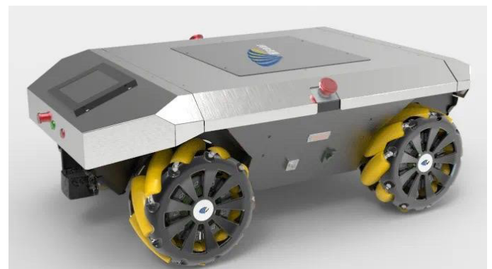
Figure 1. Representative omni-directional mobile robot.

Received: 02 May 2023, Manuscript No. Ara-23-98648; Editor assigned: 04 May 2023, PreQC No. P-98648; Reviewed: 16 May 2023, QC No. Q-98648; Revised: 22 May 2023, Manuscript No. R-98648; Published: 29 May 2023, DOI: 10.37421/2168-9695.2023.12.259