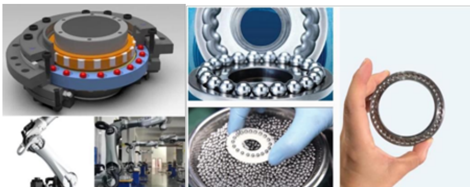
Figure 6. HSOAR precision cycloidal reducer gear box, precision cycloidal ball reducer, anthropometric robotic arms, shaped hard alloy steel balls, ball steering set power A-head.