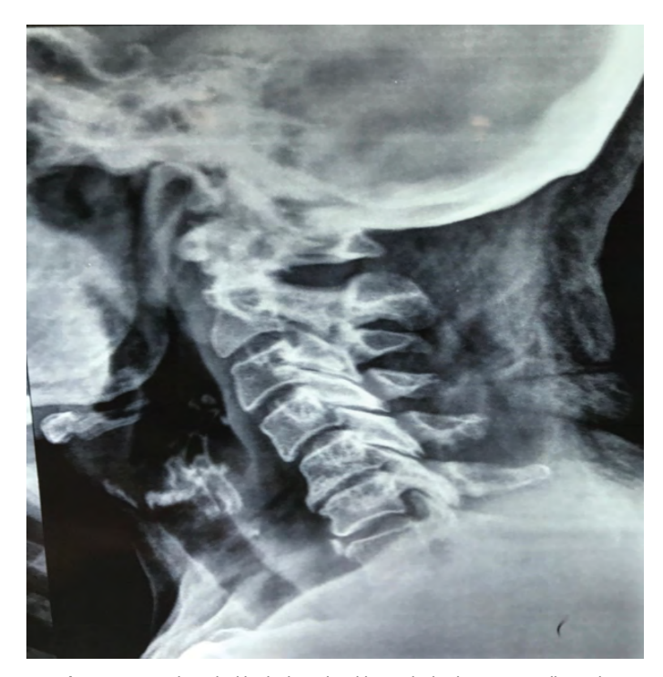
Figure 2. Normal cervical lordosis and stable cervical spine as per radiograph.