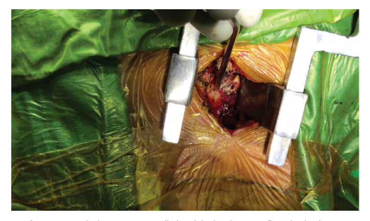
Figure 4. Mcculochs retractors applied and the level was confirmed using image.