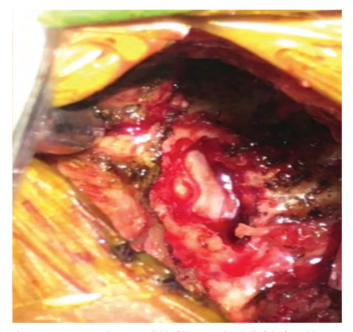
Figure 5. Facetectomy done at medial half but more than half of the facet joint was preserved.