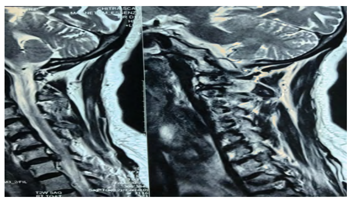
Figure 1. Resonance Imaging (MRI) having unilateral cervical foraminal stenosis or unilateral postero-lateral soft disc herniation.

Visual Analogue Scale (VAS) score was used for radicular pain to evaluate clinical outcomes. Plain cervical radiographs were performed before surgery, after surgery and at the time of final follow-up to asses spinal instability and