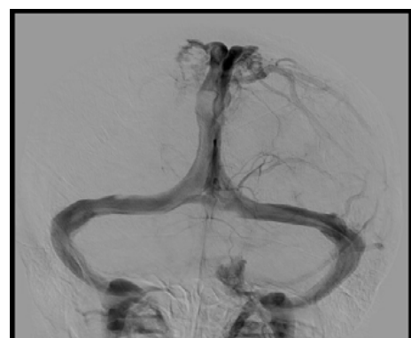
Figure 2: Cerebral angiography of both carotid arteries and left vertebral artery in venous phase and sagittal projection, showing moderate and segmental stenosis of the distal third of the superior sagittal sinus due to the meningioma.