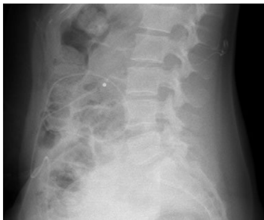
Figures 3A and 3B: Simple abdominal radiography in anteroposterior and lateral projections after placement of lumbo-peritoneal.

cortical veins draining to the superior sagittal sinus [5].