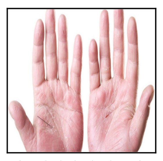
Figure 2: Shows hyperkeratotic papules on Hands.