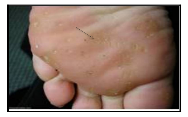
Figure 1: Shows hyperkeratotic papules on Feet.

Mucosal surfaces were not involved. Biopsy sample was received. On histopathological examination of biopsy revealed massive hyperkeratosis over sharply limited area with depression of malphigian layer below general level of epidermis. There was increase in the thickness of granular layer. The dermis was free of inflammation. Compilation of clinical and laboratory data helped to conclude the diagnosis of Palmoplantar Keratoderma-Punctate type.