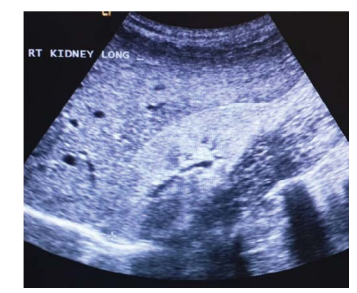
Figure 3A: Right kidney.