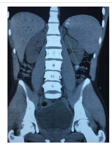
Figure 2: CT scan image showing the left kidney measuring at 8.4cm and the right kidney at 7.9 cm.