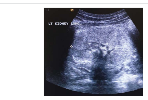
Figure 3B: Left kidney.

analysis of his chromosomes revealed a homozygous deletion of 2q13 that encompasses NPHP1.