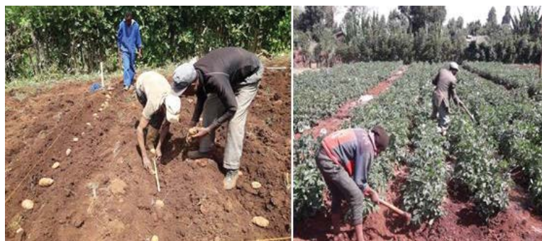
Figure 2. Potato tuber at planting and maturity stage.