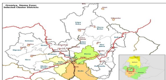
Figure 2. Map of the study area.

The study was employed in the Jimma Zone, located in South Western Ethiopia. Jimma Zone is located between 7°13' to 8°56'N latitude and 35°49 to 38°38'E longitudes. The total population of the study area is 212,277, of which 109,480 (51.57%) is male and 102,797 (48.43%) is female. Agroecological, the Jimma zone is classified into three zones: Highland (35%), midland (47%), and lowland (18%). The largest part of the Jimma zone is midland and the zone is suitable for agricultural yield. The mean yearly rainfall ranges from 1, 200 mm and 2, 500 mm and has a mean annual temperature lies between 20°C and 25°C. The Jimma Zone receives low rains in March while high rains in July. The main production season is July and August during which all major cereal crops are grown. The largest part of this Zone falls within the south Western part of the country. The elevation in the Jimma zone varies from 880 m.a.s.l to 3,340 m.a.s.l. The total area of the Jimma zone is 1.1 million ha. The relatively high population density in the zone coupled with the high proportion of the young population in the rural areas of the zone exerts considerable pressure on farmland (Figure 2).