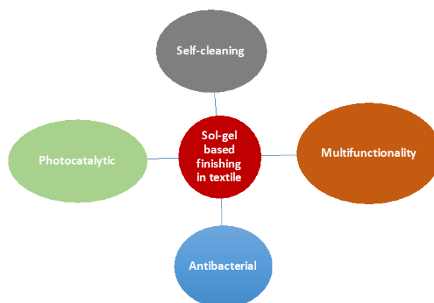
Figure 1. The various applications of nanoenzymes and nanostructures in textiles.

The other various applications of nanostructures and nanoenzymes are illustrated in the Figure 1 [19].