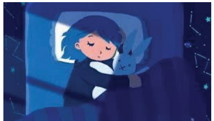
Figure 4. Adolescents.

The effect of cannabis on sleep seems to depend on multiple factors such as composition, dosage and route of administration [11]. Mondino et al. [11] suggest that vaporization is the recommended route for the administration of medical cannabis however, there is not yet any published research about the effects of vaporized cannabis on sleep. Vaporization of low doses of a specific type of cannabis produced a slight increment of non-rapid eye movement (NREM) sleep and subtle modifications of high frequency bands power during the light (resting) phase as well as spindle coherence during the dark phase, which are associated with cognitive processing [11]. Mondino et al. [11] also reassure the importance of further exploring the sleep-promoting properties of cannabis (Figure 5).