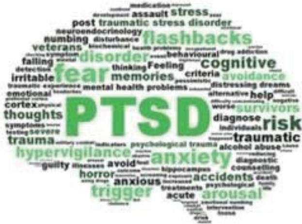
Figure 2. Post traumatic stress disorder.