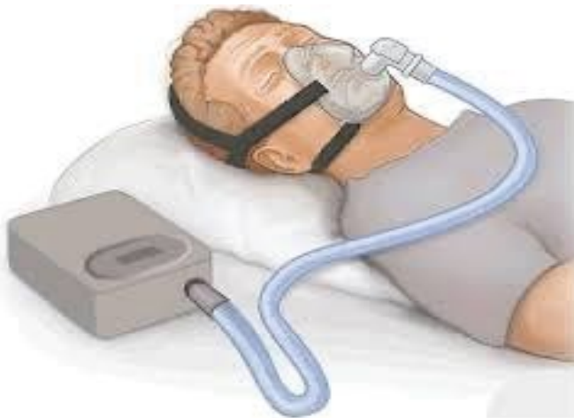
Figure 3. Obstructive sleep apnea.

Ramar et al. [6] recommend patients with OSA should discuss their treatment options with a licensed medical provider at an accredited sleep facility (Figure 3).