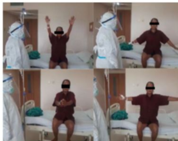
Figure 2. Rehabilitation treatment.