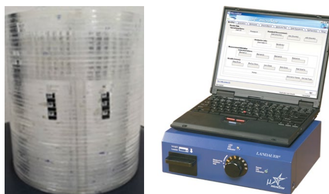
Figure 1. Cylindrical phantom and a microstar reader.

First, the photon beam qualities were calibrated from gamma-ray source of ^{137}\text{Cs} . Three nanoDot dosimeters were inserted into the cylindrical phantom holes representing an eye. These dosimeters were irradiated at Secondary Standard Dosimetry Laboratory (SSDL), TINT. The delivered air kerma values were 2.0 mGy at 0 degree angle of incidence. These values were traceable to Physikalisch-Technische Bundesanstalt (PTB), Germany. Delivered (Hp(3))