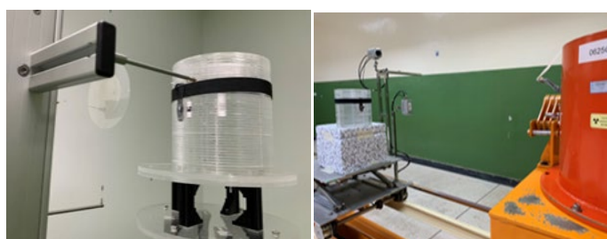
Figure 2. Irradiation of Cs137(left) and 90 Sr- 90 Y sources (right) to nanodot dosimeters in term of eye lens dose.

The relative risk of NM staffs was calculated by the ratio of incidence risk among an exposed group and incidence risk among a non-exposed group (Table 3). Relative risk was 6.77 (95% confidence interval 2.435 to 18.846). The Office of Atoms for Peace, Thailand, announced in the Royal Gazette (2018) with the reduction of the dose limits and recommended to Individual Monitoring Service laboratory for development of the lens of eye dose calibrated at eye adjacent instead of wearing dosimeter at whole body which not represented to real dose (Figure 3) [5].