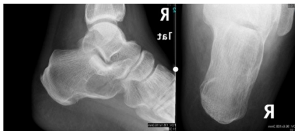
Figure 1: Calcaneus lateral and axial X-rays.

Radiographs of bone xanthoma usually show a small, well-circumscribed, purely osteolytic lesion, often accompanied by a surrounding rim of sclerosis with a narrow zone of transition. Rarely, lesions can have an aggressive appearance with a wide zone of transition and may be multifocal. Cortical expansion can be observed in some cases. However, intra-lesion calcification, cortical destruction and soft-tissue extension is absent (Figure 1) [4,8,12,13].