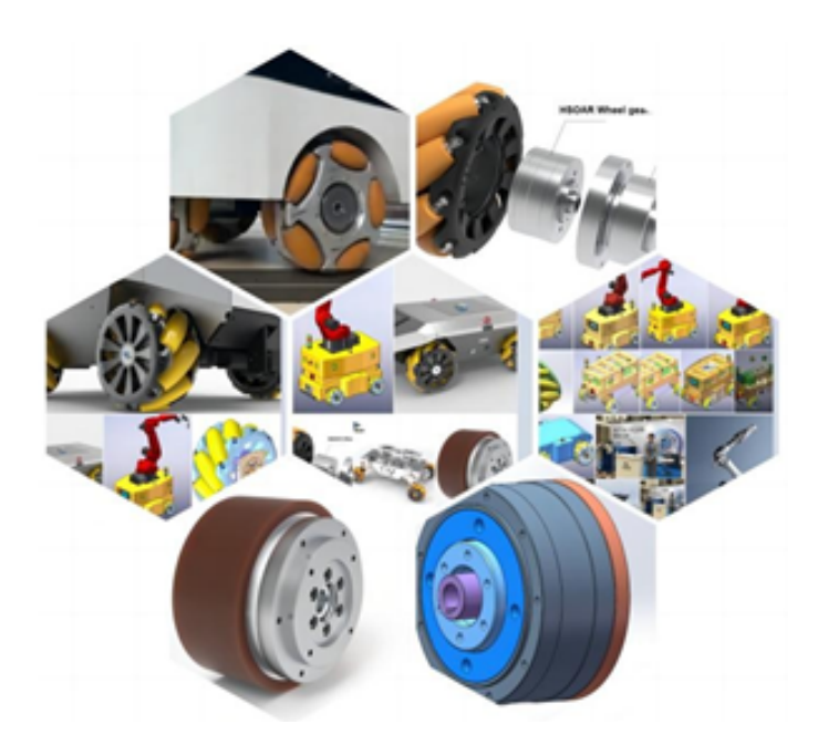
Figure 7. HSOAR precision cycloidal wheel reducer for mobile robot platform.