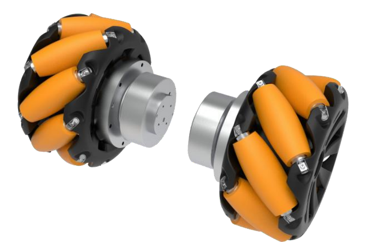
Figure 3. Mecanum wheel, a conventional wheel with a series of rollers attached to its circumference with an axis of rotation at 45° to the plane of the wheel in a plane parallel to the axis of rotation of the wheel.

Related tests show, there is abnormally high losses that exist in some planetary topologies. Some gear meshes may encounter both high speeds