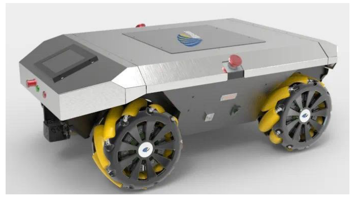
Figure 1. Representative omni-directional mobile robot.

Received: 02 May 2023, Manuscript No. Ara-23-98648; Editor assigned: 04 May 2023, PreQC No. P-98648; Reviewed: 16 May 2023, QC No. Q-98648; Revised: 22 May 2023, Manuscript No. R-98648; Published: 29 May 2023, DOI: 10.37421/2168-9695.2023.12.259