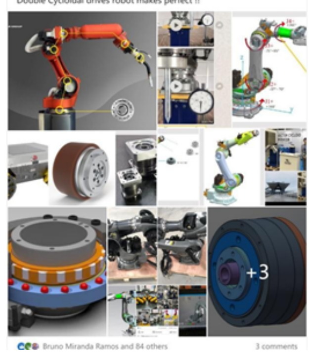
Figure 8. Automated welding robot, manifold with vent, configuration of the 6-DOF heavy payload industrial robot, drive wheel, gearbox.