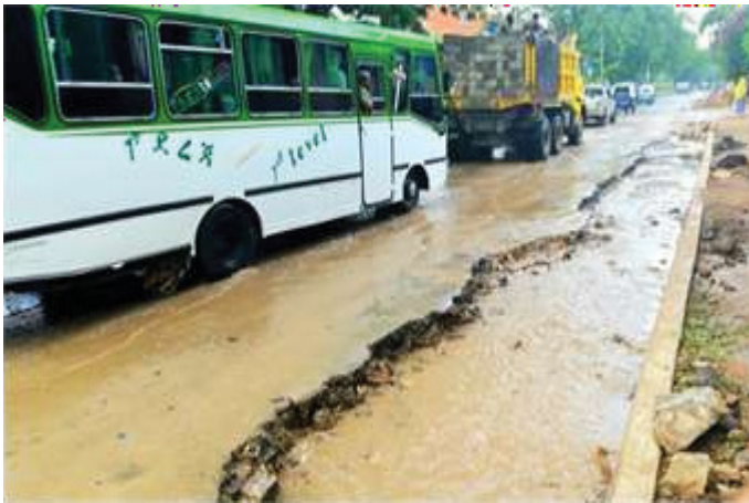
Figure 5. Flooding to both the right and left side of the drainage system.