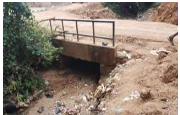
Figure 3. Almost all filled with the sedimentation of side ditches.