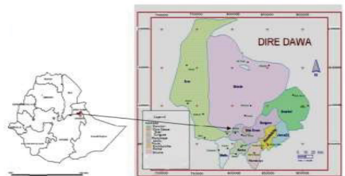
Figure 1. Location map of the study area.

The results from personal observation of the site have been figure out in pictures which existed in Figures 1- 6 part bellows, and that shows the destruction of traffic flow by flooding the road, side deterioration and formation