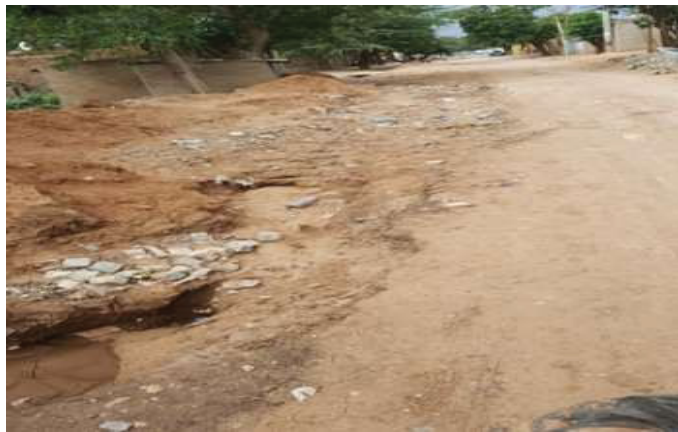
Figure 6. Eroded roads and gully formations due to lack of side ditches.

of gullies on the road sides, culverts has been filled with debris and flood overtopped on the roads etc.