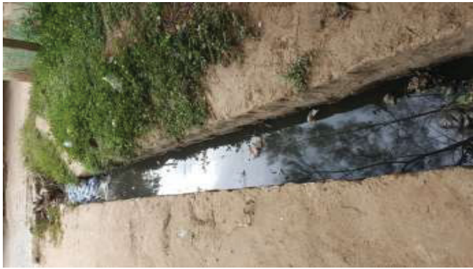
Figure 4. Solid waste and dust accumulation in the drainage system and creates water stagnation in the side channel.