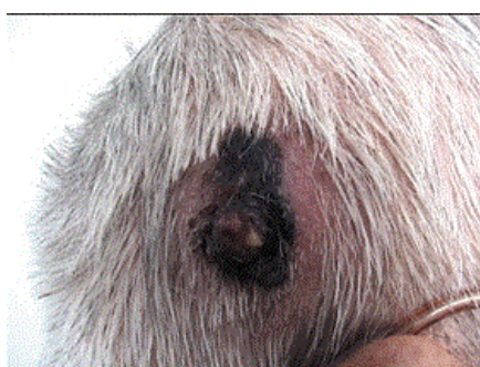
Figure 3: Nodular melanoma (NM).

A 74 year old patient asked for dermatological examination because of injury of a mole in the hairy part of his head and occasional bleeding. Anamnesis on the duration of the disease is unreliable. Photo-type 1. Before the age of 20 he had had several sunburns. At the moment of the examination a 10 mm tumor nodule of grey-pink color was noticed in the right parietal region with a slightly elevated dark macula of irregular contours (Figure 3).