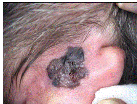
Figure 1: Superficial spreading melanoma.

with a phase of vertical growth and multifocally present ulcerations of epidermis.