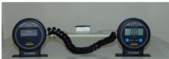
Figure 1: Dual Digital Inclinometer

Acumar TM digital inclinometer, Lafayette Instrument Company from USA (model ACU002) was used for all inclinometric measurements (Figure 1). This device consists of two sections, linked by a line. The main (reference part) has an LCD screen, to show the calculated data. For exact measurement, the two sections should align with each other, parallel to the horizontal plane, so the number "zero" appeared on the screen.