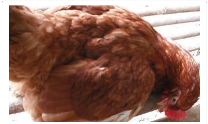
Figure 2: NDV infected layer chicken of 29 weeks of age showing nervous signs (twisted neck and paralysis) [40].

Polymerase chain reaction: The duplex PCR is done based on principle that it has the ability to amplify and differentiate multiple