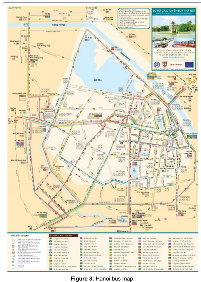
Figure 3: Hanoi bus map.

Second, to develop public passenger transport, apart from investment in facilities, infrastructure, logistics facilities, as well as advanced system of management and administration equipment, the development of infrastructure for bus operation (such as priority lane,