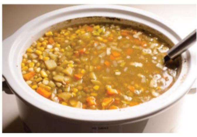
Figure 8. Soup.

Takra: It is a liquid preparation prepared by continuously churning the curd for one prahara (3h) with different ratios of water added (Figure 9) [15]. Takra contains many useful bacteria like lactobacillus acidophilus, and it is rich in calcium, Probiotics, Vitamin B-12, Vitamin B2, Potassium and Magnesium. It is very good for improving digestion. It can be taken with adding Roasted cumin powder, dry mint powder, and black rock salt.