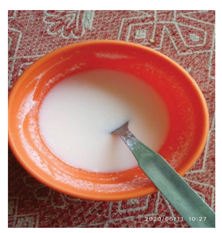
Figure 9. Takra (Buttermilk).

The Vedas summarised about the various kinds of traditional dietary methods of preparations which has a great effect on our health and it maintains our physical health as well as mental health. Dietary Methods of diet preparation in Vedas states a large category of well nutritional and complete diet, like when and how much quantity and which quality of food have to be taken. In Modern Era, People have no proper schedule regarding diet, that how to eat, proper