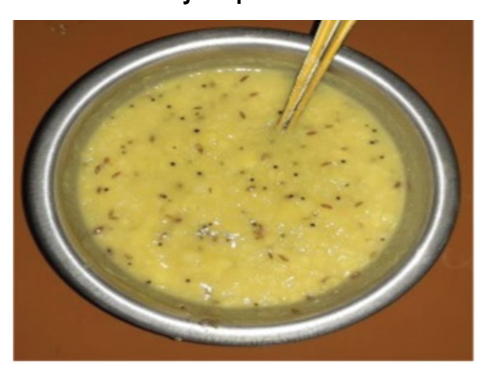
Figure 7. Khichdi.