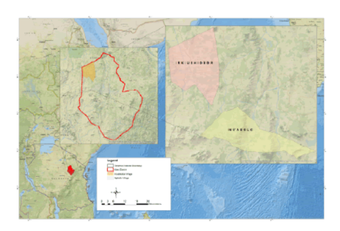
Figure 1 Map of Tanzania showing Kiteto District and the two study villages.

As defined by Kothari [13], a research design is the arrangement of conditions for the collection and analysis of data in a manner that aims at combating relevance to the research purpose and economy in procedure. The research design for this study was cross-sectional whereby data were collected in single point in time, combining qualitative and quantitative approaches.