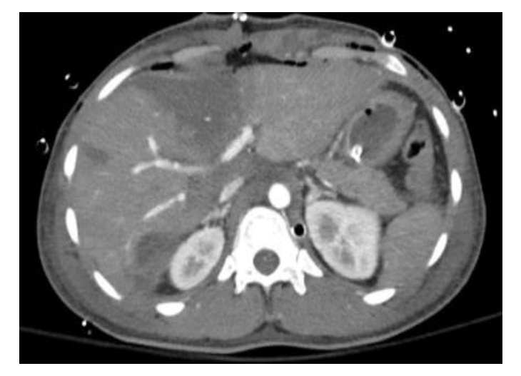
Figure 1. CT Abdomen and pelvis with IV contrast. Large wedge-shaped infarct segments 4A, 4B, 5 and 8.

His hospital stay was significant for persistent fevers associated with shock liver secondary to ischemia (Figure 1). Broad-spectrum antibiotics were started with no other source identified. On hospital day 6, he was briefly extubated and found to be neurologically intact but required high flow nasal cannula. He was subsequently reintubated less than 12 hours later. After reintubation, a bronchoscopy with bronchioalveolar lavage (BAL) was performed in which