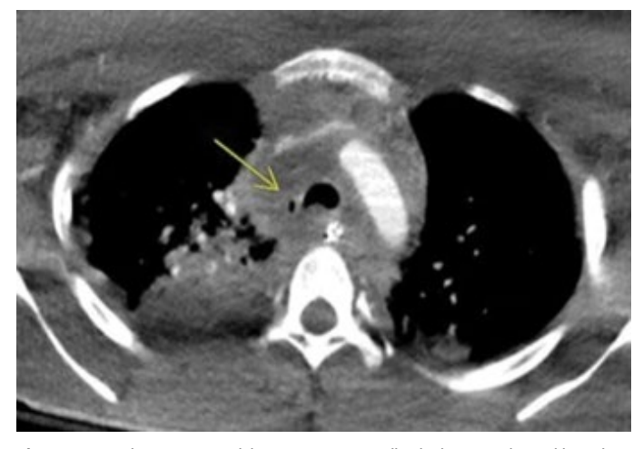
Figure 2. CT chest: Increased heterogeneous mediastinal attenuation, with regions of enhancement concerning for mediastinitis. Pneumomediastinum, along the right tracheal margin with subtle breech of the right lateral tracheal wall.