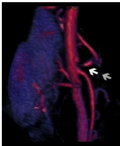
Figure 1: AngioRM 3D-reconstruction image showing compression of the celiac axis by the median arcuate ligament hypertrophy.