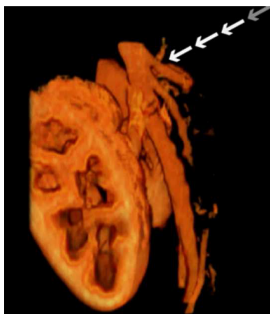
Figure 3: Angio TC 3D-reconstruction image showing the complete celiac artery patency after two months from the operation.

Intraoperative Duplex Ultrasound in both of our cases, performed in the end of the operation, attested the normalization of the blood flow