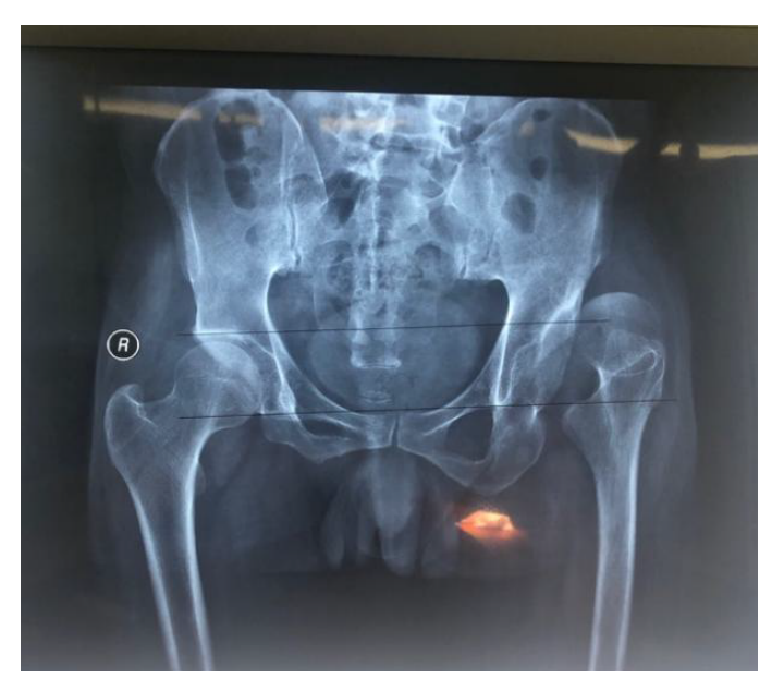
Figure 1. Patient X-ray image before the operation.