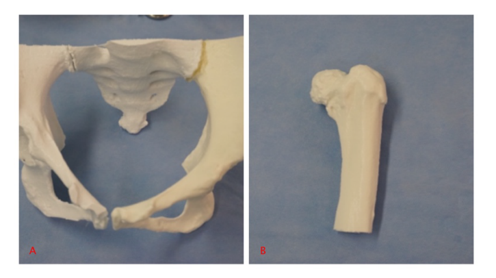
Figure 3. 3D printed models.

We performed the surgery through the posterior-lateral approach. The patient was placed in the right lateral position after sciatic nerve block and lumbar plexus anaesthesia. We made a roughly 12-cm poster lateral incision on the left hip of the patient right after disinfection and draping. And the epidermis and subcutaneous tissue of the surgical area were dissected to expose the selected bony landmark according to the surgical plan. First, we compared the sterilized 3D model with the patient's structure. Second, in the preoperative design of the acetabulum cup position, we use the acetabula reamer with a diameter of 36 mm to grind to a diameter of 46 mm (Figure 4), and then we inserted a 48 mm diameter cement less acetabula cup and reinforced it with two acetabula screws (Figure 4). Time to time, we used the 3D printing model to avoid extra procedures. And then we opened the femoral medullary cavity enlarged it to the size of 10.5 with the medullary cavity file (Figure 4). We installed the femoral prosthesis with a 36mm diameter short neck head. At last,