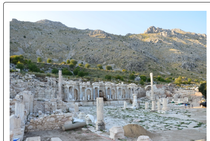
Figure 2: The Antonine Fountain, Sagalassos ancient city, Aglasun/Burdur (Original 2015).

The fountain was completely demolished after a second earthquake hit the city in AD 650. The fountain was originally constructed to add an aesthetic value the upper part of the Agora, which was also the political center of the ancient city. The monumental fountain constructed immediately in front of the existing terrace wall resembles the architecture of a theatre stage. The fountain is built using seven different stones and water fills the 81 cubic metre pool from a waterfall that cascades out a 4.5 metre high outlet in the central niche of the structure. One of the two Dionysus statues unearthed at the excavations at this location is exhibited at Burdur Museum [10] (Figure 2).