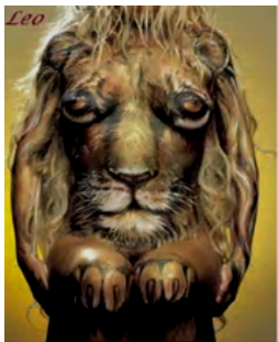
Figure 4: Face of an animal on a sitting woman body.