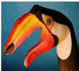
Figure 7: Wild animals painted on human hands.