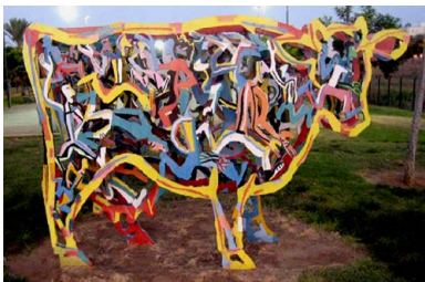
Figure 11: Metal art sculpture of a cow.