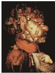
Figure 9: Painting of the Italian artist Giuseppe Arcimboldo.