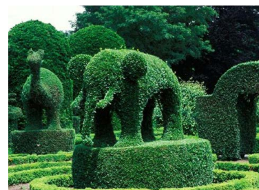
Figure 2: Elephant located in the Green Zoo in Portsmouth.