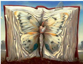
Figure 5: Livre des Livre.