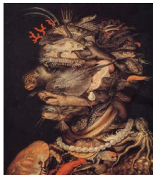
Figure 10: Painting of the Italian artist Giuseppe Arcimboldo.