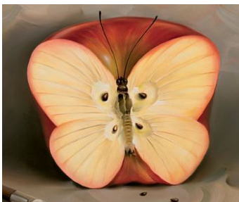
Figure 6: Papillon Pomme.