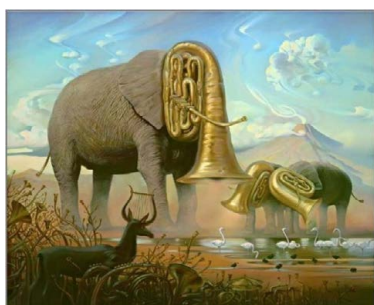
Figure 1: Sonate Africaine.