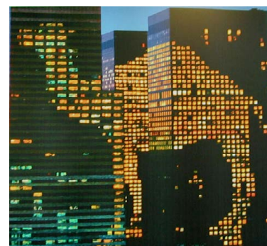
Figure 3: Light Camel on walls.