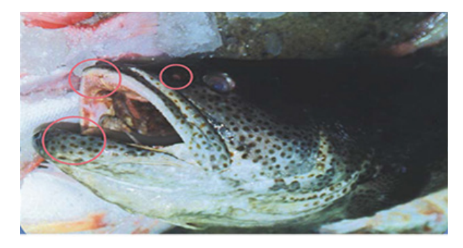
Figure 1. Fish "smell" by detecting water-soluble chemicals that enter their nostrils. They "taste" using taste buds on the lips, oral cavity and sometimes on their external body surface.

other species being affected [10,11]. Species interactions are driven by physiological processes and the behaviors they result in. Further the strength of these interactions in turn drive community structure and function under chemical contamination [12-14]. Despite the fact that the low pH may affect the physiological functions of the fish, like respiratory system [15,16], circulatory system, central nervous system [17], metabolism, growth [18], and behavior, much of the effects seem to result from the acidification of the body fluids. Fish are bilaterally symmetric and possess an olfactory organ (nose) in the anterior portion of each side of the head. Water enters the nose and circulates over the nerve cells, where specialized receptors (Figure 1) detect specific chemicals dissolved in the water and transmit signals to the forebrain.