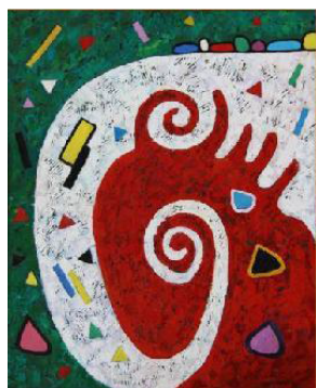
Figure 2: Immortal life.