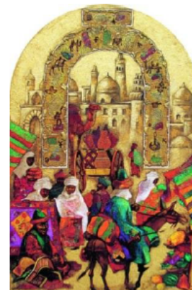
Figure 7: Mellu Bue.