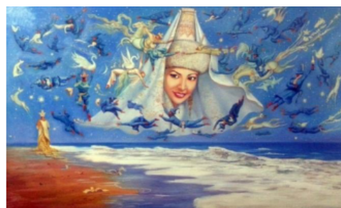
Figure 13: Ak Erke, Akzhayik.