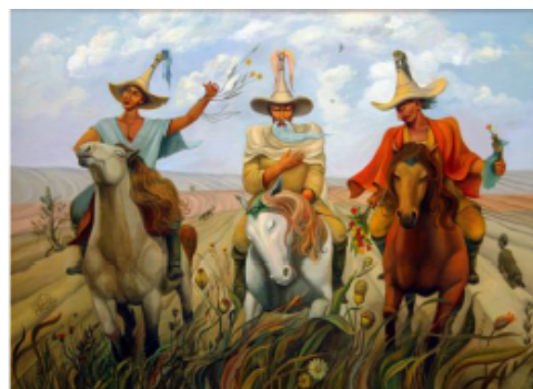
Figure 12: Three ages of Love.

it". Kile, [10] explained the Creativity of young and famous painters harmoniously coexists with modern painting and traditional classical art methods. Many elements of traditional Kazakh and traditional classic arts form new artistic directions. These new directions preserve the continuity of traditional approaches and contemporary art methods, thus, developing it in a new rhythm. Modern directions of painting in Kazakhstan expanded the subject, enriched an artistic language, and contributed to national values' and spirituality search. Additionally, modern paintings have formed a unique language, which