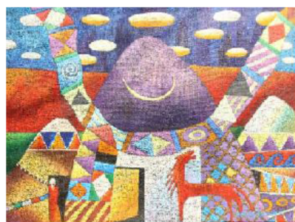
Figure 5: The Moon in the Night.