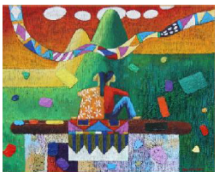
Figure 3: The Two.