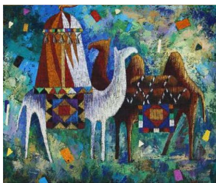
Figure 1: Expectation.

Harmony is a philosophical and aesthetic category, signifying a "high level of order diversity, the optimum Harmonies in differences is the whole system, meets the aesthetic criteria of perfection and beauty", i.e. Harmony, as it was mentioned earlier, is a set of similarities and differences, combined in a specific ratio; harmony is a concept of integrity and perfect organization of an aesthetic object, that arises through qualitative and quantitative differences and interaction between the elements. Overall, harmony is a system, a set of different and general things, which are combined in a certain ratio (Figures 1-6). According to Zaizev [8], color harmony is pleasing to eyes, it is