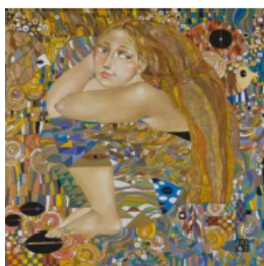
Figure 11: Tenderness.

it". Kile, [10] explained the Creativity of young and famous painters harmoniously coexists with modern painting and traditional classical art methods. Many elements of traditional Kazakh and traditional classic arts form new artistic directions. These new directions preserve the continuity of traditional approaches and contemporary art methods, thus, developing it in a new rhythm. Modern directions of painting in Kazakhstan expanded the subject, enriched an artistic language, and contributed to national values' and spirituality search. Additionally, modern paintings have formed a unique language, which