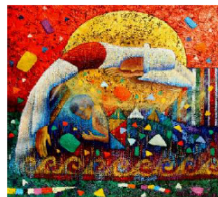
Figure 6: Lullaby.

a beautiful combination of colors, suggesting some consistency, order and proportionality among them. It is also noted by the author that the main characteristics of color may act together in different links forming different harmonious combination, and offering basic variations for lightness, saturation and brightness. The painting's proportions reflect perfect math, such as symmetry of elements, repetition of equal and alternating values of the golden section in order to create sensuously perceptible rhythm for the painting. The artist plans to affect a viewer via selecting the particular tools in his paintings. The golden proportion is a kind of symmetry (gold symmetry), and it is included in general mathematical symmetry relations. Paintings, in which the focus is at the geometric center of the canvas, are not considered as asymmetric. They are symmetrical, but it is a special kind of symmetry, it is symmetry of gold. Overall, this symmetry and proportioning systems give the artist a self-examination tool, in order to check what is made intuitively and through feelings. A series of pictures by Nelly Bube Vitalievna are dedicated to the Great Silk Road. The author's