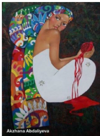
Figure 9: Pomegranate.