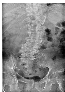
Figure 3: Lumbar X-ray for case 3: P-A view.