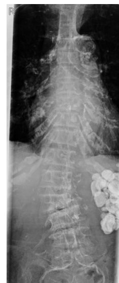
Figure 4: Lumbar X-ray for case 4: P-A view.

The physician tried transdermal buprenorphine for pain management since May 2017. Also, tramacet 325 mg under oral use twice a day was prescribed for three days in the beginning stage of transdermal buprenorphine therapy. The therapy relieved the symptom of persistent pain under good compliance.