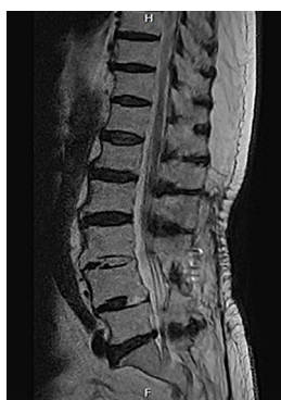
Figure 2: Lumbar X-ray for case 2: lateral view.

The third patient was a 69-year-old male with history of uremia under hemodialysis for two years (end stage renal disease, Creatinine:10.44 mg/dL, eGFR:40.65 ml/min/1.73 m 2 ), who complained persistent low back pain for years, and received epidurolysis twice, but the pain still persisted (Figure 3).