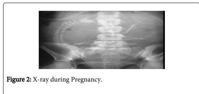
Figure 2: X-ray during Pregnancy.