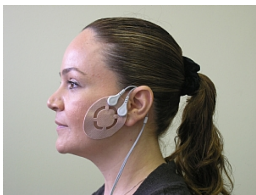
Figure 2: PainShield placement for TN.

The PainShield is a self-contained SAW device, comprising a driver and an actuator patch. The patch generates acoustic waves at approximately 96 kHz. The patch is attached on the lateral face (Figure 2), and if necessary can be further held in place with a self-adhesive bandage. The device produces active acoustic waves for 30 minutes and then idles with no acoustic wave generation for thirty minutes. The device cycles for six and a half hours before automatically shutting off.