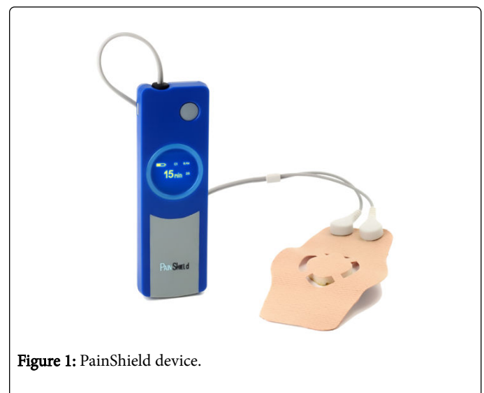
Figure 1: PainShield device.

Ultrasound is a directed acoustic wave that has varying physiological effects depending on the intensity, frequency, and amplitude of the wave. Acoustic waves range from Surface Acoustic Waves (SAW) at the low end of frequency to Shockwaves at the high end. SAW has been shown to decrease inflammation, cause neo-