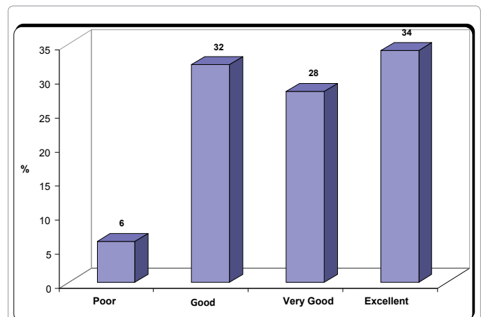
Figure 1: Improvement of freckles after treatment with 1064 Q-Switched Nd-YAG.