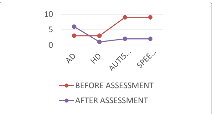
Figure 2: Changes in the quantity of disorders pre and post assessment (with VAS & ABC) among the study sample.