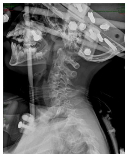
Figure 2c: Case 2, RX cervical spine, lateral view with halo-jacket.