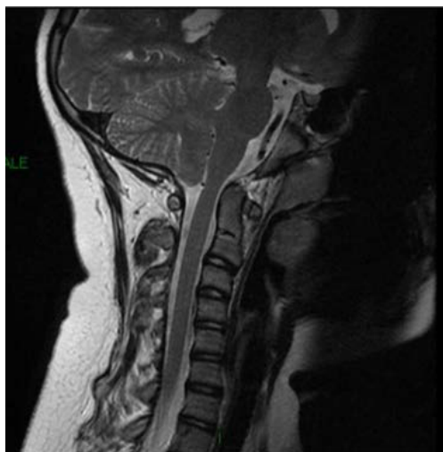
Figure 1b: Case 1- MRI examination, the initial sagittal image.