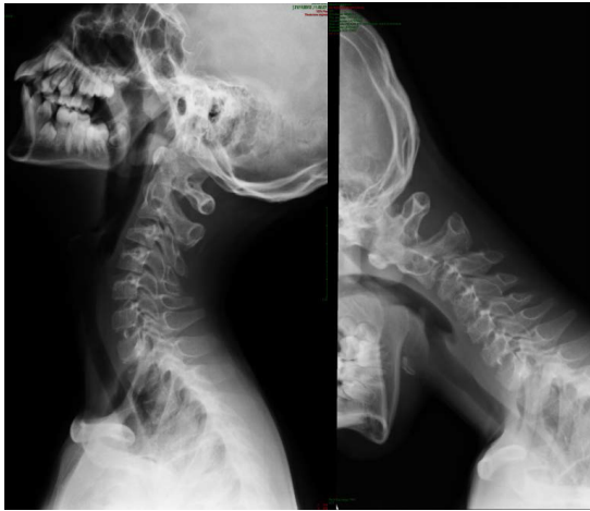
Figure 2d: Case 2, RX dynamical examination in lateral view.