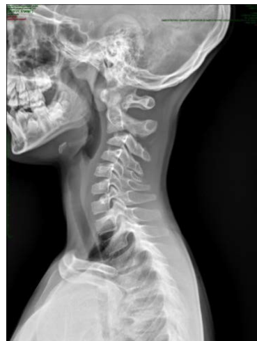
Figure 2a: Case 2, RX image of fracture luxation C2-C3.

persistence of pain further diagnostic investigation is mandatory. The conservative treatment in cases of mild trauma should be considered as a valid treatment with satisfactory results.