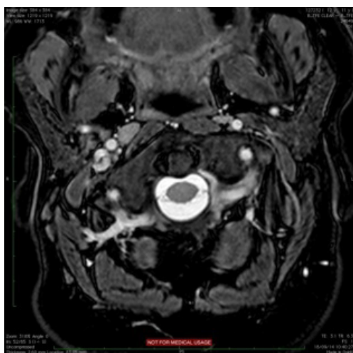
Figure 1c: Case 1, axial MRI image.

difficult to manage. The majority of these injuries are sustained from a motor vehicle crash (27 of 52, 52%) while the remaining are the result of falls (15%), bicycle accidents (11%), sports-related injuries (10%), walking accidents (8%), or motorcycle crashes (4%). Global mortality rate in this kind of injuries is 13%. Although the incidence of spinal cord injury is relatively low (1% to 2%) in the pediatric population cervical trauma arrives to 60%-80%, while in the adults cervical spine injuries constitute 30% to 40% of all vertebral injuries [5]. Whereas these injuries are rare, the most appropriate and cost-effective treatment remains controversial [6]. The presence of a modest trauma with rotary dislocation makes necessary a deep clinical examination and evaluation of comorbidities (case 1). A major trauma can lead to a lesion apparently light or an unrecognized and underestimated instability (case 2). The cervical trauma in childhood is often under or overestimated. The physiological hyperlaxity often causes errors of judgment because the lesion cannot be identified immediately. What these cases have taught us is that in case of minor trauma some other causes (rheumatology, inflammatory) should always be investigated starting from the history, considering the existence of other signs and symptoms of disease. The correct diagnosis is the first step of the treatment and in case of