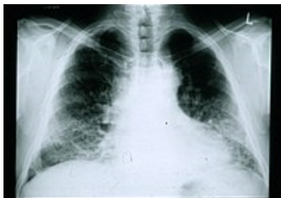
Figure 2: A chest radiograph of a patient with IPF. Note the small lung fields and peripheral pattern of reticulonodular opacification.

Diagnosis of IPF (when these other causes do not exist) is best made by high resolution computerised tomography (HRCT scan) or less specifically, chest X-ray since lung biopsies pose significant risks of reducing oxygenation even further (Figure 1 and Figure 2) [5].