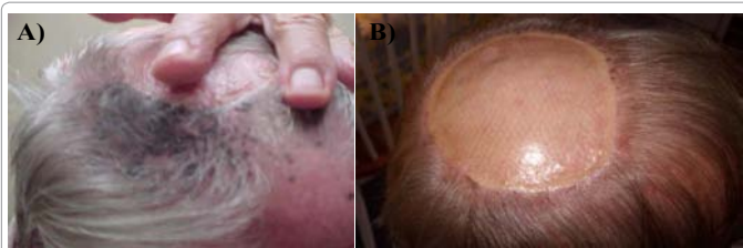
Figure 1: (A) On the left, a close-up photograph of a section of the scalp of patient # 2 prior to intralesional therapy showing the massive in transit metastases next to the skin graft, and (B) on the right, a photograph of the whole scalp of the same patient after receiving GM-CSF intralesional therapy. Note the complete clinical response which was confirmed pathologically. This patient is alive free of disease for 44 months to date.

disease, there was not enough time for repeated weekly intralesional injections of either cytokine. Therefore, the patient received a single short course of intralesional 500 µg GM-CSF on day # 1, followed by IL-2 at 11 million IU/day on days # 2 and 3 at the primary and satellite sites. One week later, the standard surgical procedure was carried out that included wide excision of the skin, subcutaneous tissue and the underlying fascia with 2 cm margin from the primary site and the satellite and a total axillary LN dissection. All the resected tissues were examined pathologically.