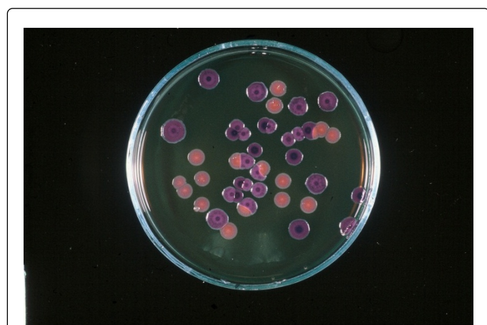
Figure 1: Elimination of F + lac plasmid from lactose negative E. coli . The F + lac operon was deleted by mutation and the F + lac plasmid was introduced into cells that were responsible for lactose fermentation by these cells. These cells F + lac cells produce dark blue colonies on EMB agar. However when the cells were cultured in the presence of promethazine at sub- inhibitory concentrations for 20-24 hrs, the plasmid was eliminated from the fraction of the cell population and these cells formed pink colonies on the EMB agar plate [9]

It was interesting for us to note that different psychopharmacoons with tricyclic structures had similar antibacterial effects on bacteria and plasmid replication. Some modification in chemical structures of phenothiazines [e.g.sulphoxide] resulted in the loss of plasmid curing effects. However when some naturally occurring “psychopharmacoons or pain killers” e.g cannabis derivatives were studied, the hallucinogenic cannabinoids did not affect plasmid replication and bacterial growth. Only the non-hallucinogenic tetrahydrocannabinolic acid was able to eliminate the bacterial plasmids. This compound had