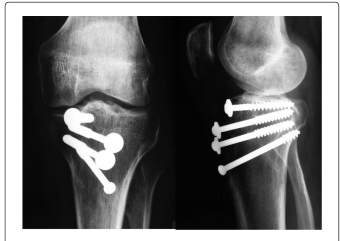
Figure 3: Osteosynthesis of the Figure 2 fracture using 4 antero posterior 6.5 cancellous screws: Result at 9 months follow-up.

Radiological parameters studied were: quality of fracture reduction, consolidation, secondary displacement, material failure, osteoarthritis according to modified Ahlbäck classification [14-18].