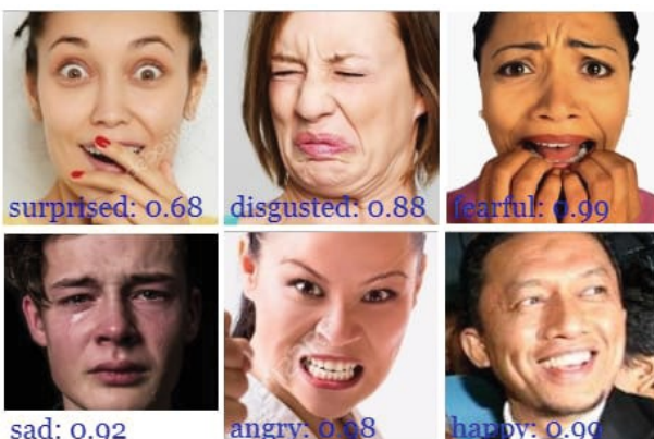
Figure 1. Classification of expression.

This method implemented through a camera in the classroom. This system is also helpful for detecting and recognizing multiple faces in the classroom with acquired images. So it can reduce work for faculty and also concentrate on teaching class.