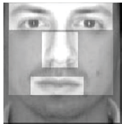
Figure 3. Face recognition using template matching.