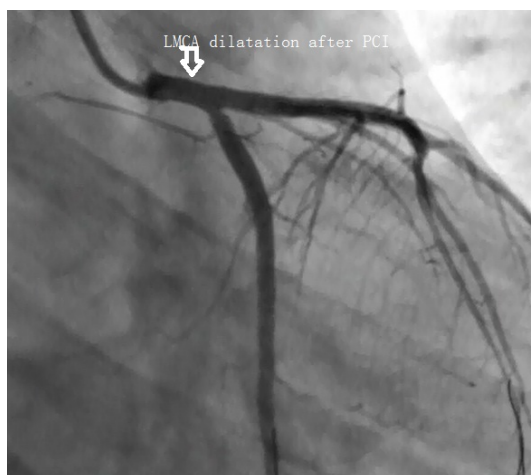
Figure 3: Coronary angiography following primary angioplasty with drug eluting stent shows normal flow in the left main coronary artery (arrow).