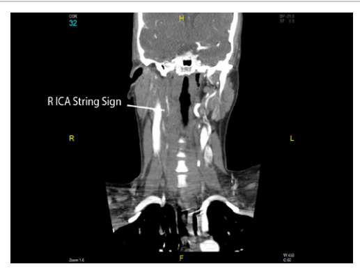
Figure 1: This image shows dissection of the right internal carotid artery, which was the etiology for amaurosis fugax. This is noted as a the string sign, representing the extent of the dissection.