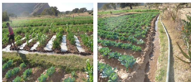
Figure 1: Products of small-scale irrigation, Abraha Atsbiha, Kilte Awlaelo.