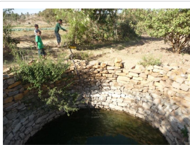
Figure 4: Treadle pump from ponds, Mesanu.

Agricultural production vs. total revenue: Randy [26] identified that net farm income is the most watched indicator of farm sector well-