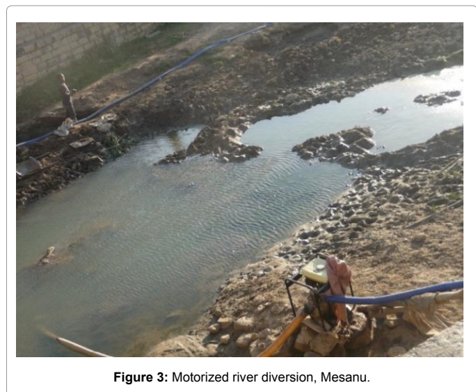
Figure 3: Motorized river diversion, Mesanu.

being, as it captures and reflects the entirety of economic activity across the range of production processes, input expenses, and marketing conditions that have persisted during a specific time period. During the survey, about 64% of the respondents confirmed that irrigation activities are improving their agricultural production and their income from the sale of agricultural products which leads to improved standard of living of their families. The average income from the sale of agricultural products for the year 2013/14 was Birr 13301.00.