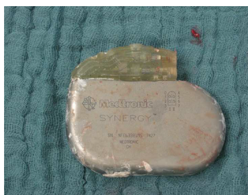
Figure 3: Microbiological study and histopathological analysis.

understanding of the numerous factors and mechanisms involved in ECM calcification in patients with chronic kidney disease, the exact mechanism remains unclear [1]. Disturbances in calcium and phosphate homeostasis manifested by hyperphosphatemia, hyperparathyroidism, elevated FGF-23, increased oxidative stress, and decreased calcification inhibitors such as fetuin-A and pyrophosphates are common in patients with end-stage renal failure. Phosphate probably initiates vascular calcification by activating Runx2 leading to differentiation of mesenchymal cells into osteoblasts [2,3]. Hypercalcemia further stimulates this process [4]. Furthermore, FGF-23 and klotho decrease phosphate reabsorption and deficiency of klotho is associated with ECM calcification [5]. Increases in both local and systemic oxidative stress are closely associated with the development of vascular calcification in