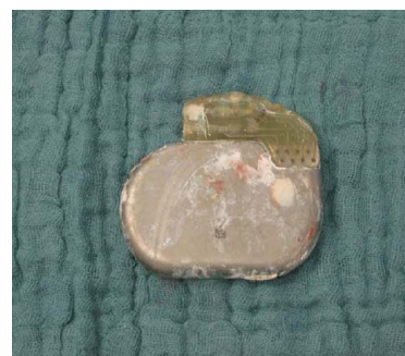
Figure 4: Presence of focal calcifications in the implantable abdominal pulse generator pocket and on the IPG itself.