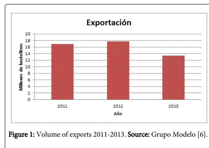
Figure 1: Volume of exports 2011-2013. Source: Grupo Modelo [6].

Grupo Modelo has achieved an extensive international geographic diversification which has a reach of 180 countries around the world and received awards in countries where it is marketed. For example in 2011 in the US, it took third in Premium Beers and won the award Hot Brands for the second time. In Europe, Australia and Latin America there was introduction of new brands such as Victoria, Pacifico, Negra Modelo and Modelo Light that had great acceptance and was sales growth up to 10% over the previous year of its introduction (Figure 1).