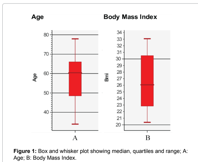
Figure 1: Box and whisker plot showing median, quartiles and range; A: Age; B: Body Mass Index.

The choice of the prosthetic to be used in ventral mesh rectopexy is the remaining area of controversy. The relatively low costs of the synthetic prosthetics are attractive, but there are safety concerns with synthetic meshes and polyester mesh appears to be associated with increased mesh related complications and its use is discouraged. Biological meshes have been shown to be safe and effective. However number of biological meshes used are small and the long-term efficacy of biological materials in pelvic floor repair has yet to be defined [8,9]. The increased cost of the bio prosthetics is also of concern [10-13]. Long-term evidence and well-powered randomized trials are needed to fully define the roles of the various meshes in