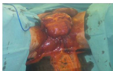
Figure 3: Intraoperative image of surgical debridement.

Our case report discusses the supportive therapeutic value of HBOT and VAC in management of Fournier Gangrene. Their combination allows continuous improvement of local wound and persisting infection enabling final reconstruction. We report a case of Fournier gangrene complicated with presence of multiple aerobic & anaerobic microorganisms including rarely occurring Pseudomonas aeruginosa . A study published in New Zealand Medical journal says that majority of patients had a mixture of causative organisms while the most common single organism were E.coli followed by Pseudomonas aeruginosa and Staphylococcus [4]. Pseudomonas aeruginosa may cause soft tissue infections with peri-vasculitis secondary due to bacteraemia but it is rarely associated with necrotizing fasciitis [5,6].