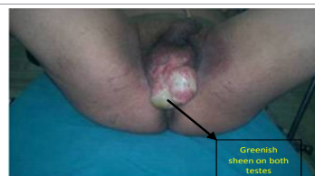
Figure 2: Progressive necrosis and greenish discoloration of scrotal skin.

He underwent five subsequent surgical debridements, with twice daily dressings (betadine/H 2 O 2 /eusol soaks/5% acetic acid soaks). His blood urea and serum creatinine came within normal range and on postoperative day 16, he was discharged home.