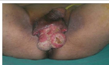
Figure 4: Postoperative image of demonstrating resolution of edema and appearance of granulation tissue.

In spite of intensive antibiotic therapy, his infection did not subside. We conducted 10 sessions of HBOT and had very good results as the bacterial count came down. Tayyab et al. [6] showed in the study involving 11 patients the positive effects of HBO in the treatment of Fournier's gangrene. HBOT provides oxygenation to ischemic areas, thus limiting the spread of infection and reducing the need for further debridement [5-7]. Hunt et al have demonstrated that oxygen adds to the effectiveness of antibiotics. In Pseudomonas aeruginosa infections HBO has an additive effect with antibiotics, reducing morbidity and mortality [10].