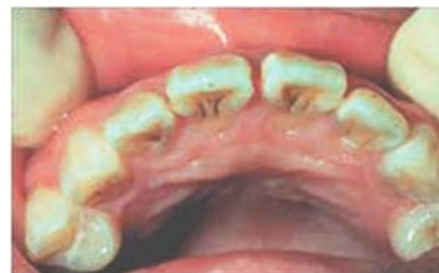
Figure 1: The evaginated odontome on the occlusal preface of premolars in Chinese persons and the shoved shaped incisor of the Mongoloids might eliminate a Caucasoid origin.

An important medico legal problem is whether the deceased infant was stillborn or survived birth with an independent existence. In the absence of soft tissues, a single primary tooth may be extracted, sectioned, and examined microscopically. The physiologic trauma of the birth event will leave permanent biologic marker in the hard tissues of the developing child at birth, and this may be visualized with