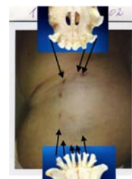
Figure 4: Bites mark on human body by an animal (dogs, cats, or rodents).

Bites may be left on human victims or on artefacts by animals. Most often these animals are dogs, cats, or rodents (Figure 4). The