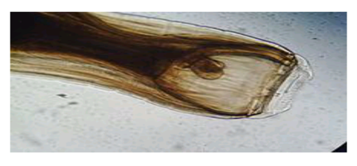
Figure 1. Close-up of Strongylus vulgaris mouthparts.

Morphology: Strongylus worms have a reddish color due to ingested blood. Strongylus vulgaris is up to 25 mm long, S. edentatus up to 40 mm and S. equinus up to 50 mm. Female worms are longer than male worms. As for other roundworms, the body of these worms is covered with a cuticle, which is flexible but rather tough. The cuticle of these species shows a circular striation. The worms have a tubular digestive system with two openings, the mouth and the anus. All species have a characteristic well formed, rather spherical buccal capsule equipped with basal teeth to cut the host's tissues (Figure 1).