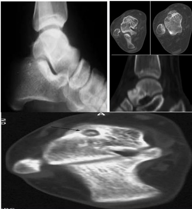
Figure 2. The AP, lateral ankle X-rays and CT of the ankle.