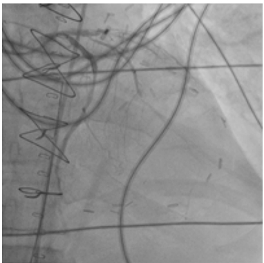
Figure 4: LCX after 3 stents deployment in LCX.