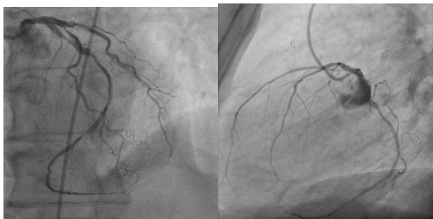
Figure 1: A and B left coronary angiography: LM: normal, LCX proximal and distal tight lesions, LAD proximal severe stenosis and diagonal branch proximal severe stenosis.

ECG, Blood Gases, Invasive blood pressure, CBC were determined