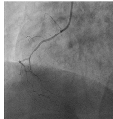
Figure 2: RCA small and diseased

The BP increase up to 125/70 mmHg, and VPCs were resolved, ST elevation normalized, after 72 hours patient was extubated. We started antiagregant aspirin 100 mg tablet daily after 24 hours of operation. He was eventually discharged home in stable condition, 12 days after the conclusion of the procedure. The treatment on discharge were aspirin 100 mg one daily, clopidogrel 75 mg once daily, atorvastation 80 mg once daily, ramipril 5 mg once daily and bisoprolol 5 mg one daily. After 3 weeks echocardiography suggest e.g. preserved LV systolic function, EF:55%, and mild mitral regurgitation.