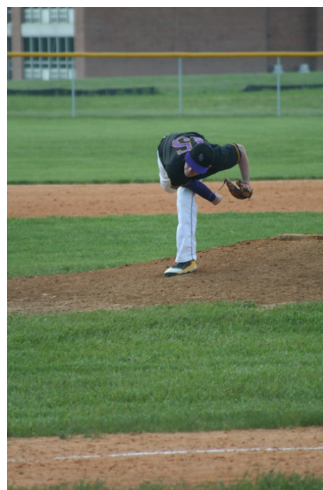
Figure 4: Post-operative pitching in a game 8 weeks after the surgery.

B: The incision opened down to the medial intermuscular septum with the vessel loop identifying the ulnar nerve.